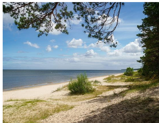
A picture of one of Latvia's many beaches. Latvia has more than 300 miles of beaches.

Did you know that over half of Latvia's territory is covered with forests? Additionally, approximately one fifth of the country is made up of nature preserves. Though it's roughly the size of West Virginia, Latvia boasts 4 national parks, 42 nature parks and 260 nature reserves. Now consider that Latvia has over 300 miles of coastal beaches, 12,000 river sand over 2,000 lakes not to mention all wildlife contained therein. It's no